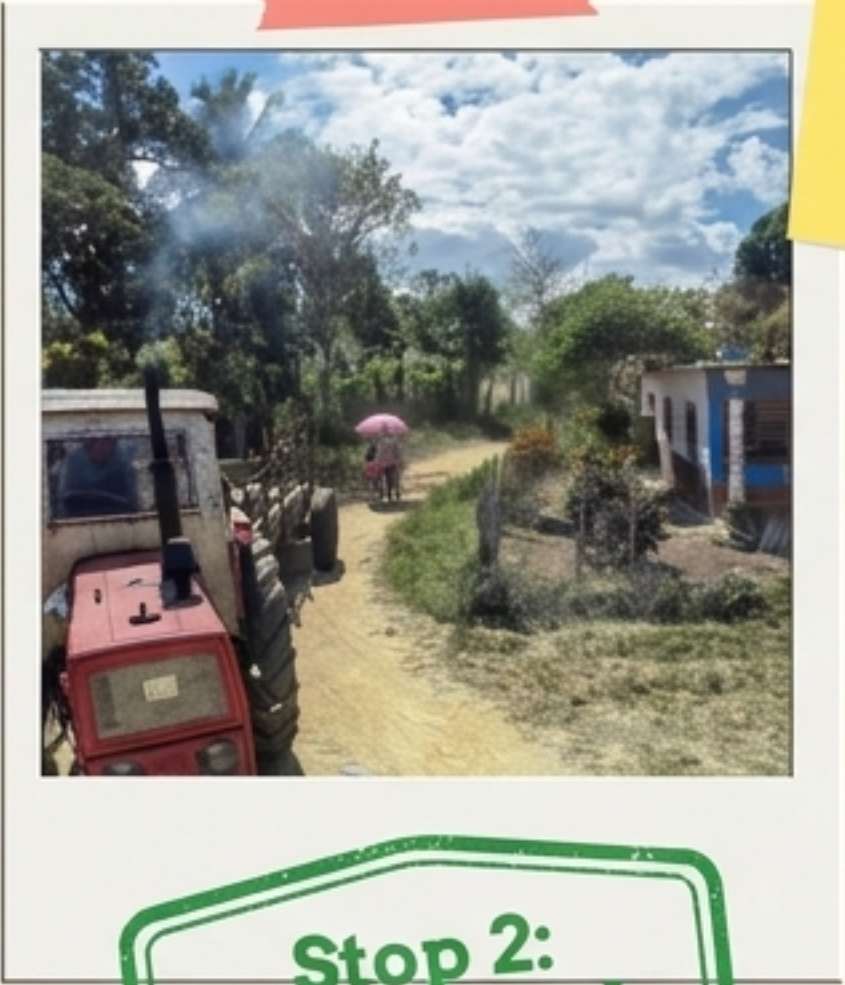
Stop 2: The Rural Heart