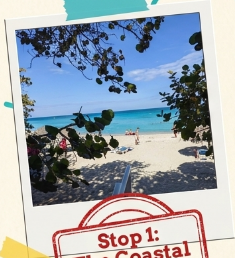
Stop 1: The Coastal Shores

Welcome to Cuba! Today, we will travel through three unique landscapes to build your descriptive vocabulary.