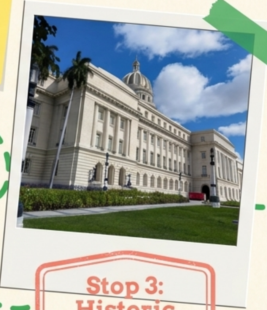
Stop 3: Historic Havana